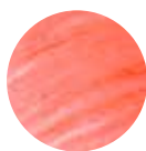
FRUIT PUNCH OMC020-FP