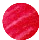
RASPBERRY RUSH OMC020-RR