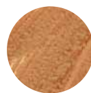
HONEY KISS OMC020-S