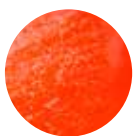
CANDY APPLE OMC020-CA