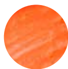
ORANGE FRIZZ OMC020-OF