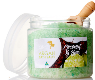
COCONUT & WILD LIME OMBSCWL

Natural Vitamin E – (Tocopherol) acts as an antioxidant and assists with skin conditioning