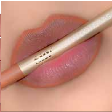
NUDE 4 MID TONE NUDE - SILKFCN4LL