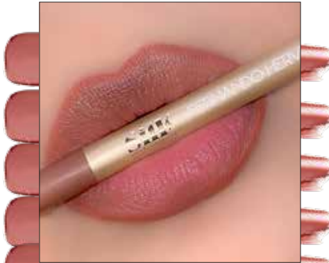
NUDE 5 MID TONE ROSY NUDE - SILKFCN5LL