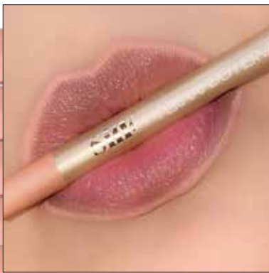
NUDE 1 LIGHT BEIGE NUDE - SILKFCN1LL