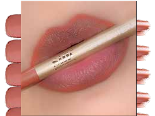
NUDE 6 DEEP ROSY NUDE - SILKFCN6LL