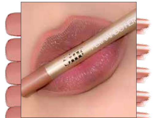
NUDE 3 PEACHY BEIGE NUDE - SILKFCN3LL