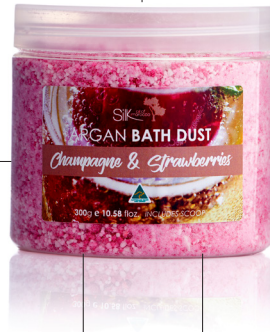
Product Code: OMBDCS Size of tub: 300 grams